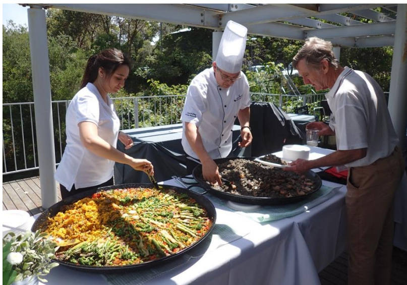
Paella on Day 2 of the ASWF