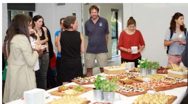
Celebrating Spanish Culture with Spanish Food