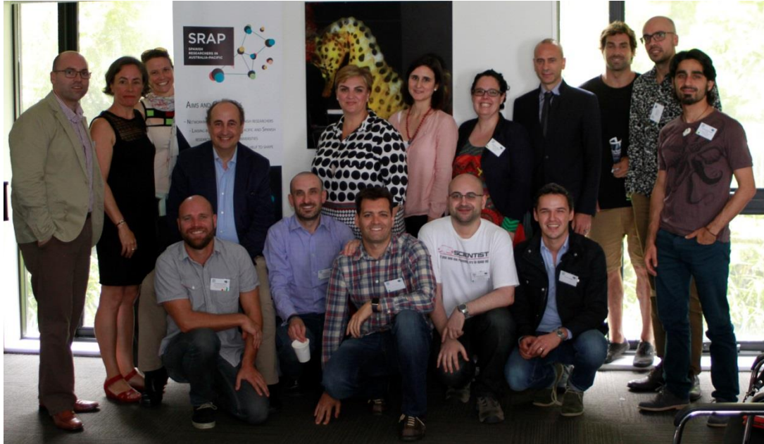
SRAP members that attended the third day of the Australia-Spain Water Forum

Spanish culture was again celebrated through a lunch which included a selection of Spanish tapas and pinchos.